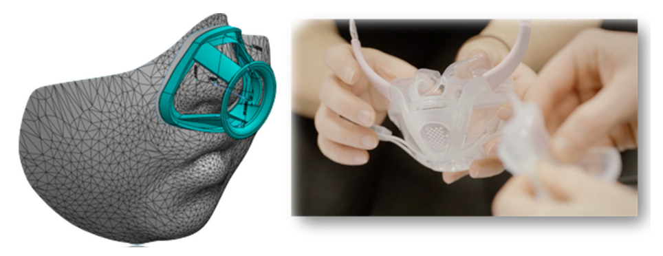
Figure 1. Facial mapping to develop a 3 dimensional model of a framework for a mask that will fit directly onto child's face for non-invasive ventilation ( left ). 3D printed bespoke non-invasive ventilation mask ( right ) [8].

The application of 3DP in pediatric healthcare has already been applied in specialties such as surgery, dentistry, drug delivery, orthotics and prosthetics, organs and tissues, ventilation masks, and interactive interfaces for robots and manipulators. One of the major advantages of 3DP in pediatrics is the ability to provide a bespoke product that aligns with the need for versatile manufacturing in relation to increasing body size and anatomical changes with growth. An example of this is the recent development of 3D custom-made masks for non-invasive ventilation that can accommodate the anatomical facial changes associated with growth (Figure 1) [8]. 3DP can be inexpensive, less time-consuming, and more controllable than traditional manufacturing techniques for custom-made devices—costs for molds and waste produced in machining by chip removal are reduced; milling, forging, and finishing phases are not necessary; less manual handwork is needed; and human error is reduced [31,32].