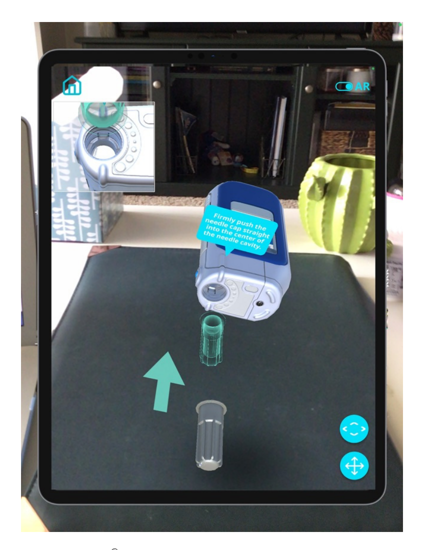
Figure 3. Easypod<sup>®</sup> augmented reality (Merck KGaA, Darmstadt, Germany). Augmented reality is used to train caregivers and patients to load a growth hormone filled cartridge into the Easypod growth hormone injection device, with permission form [54].