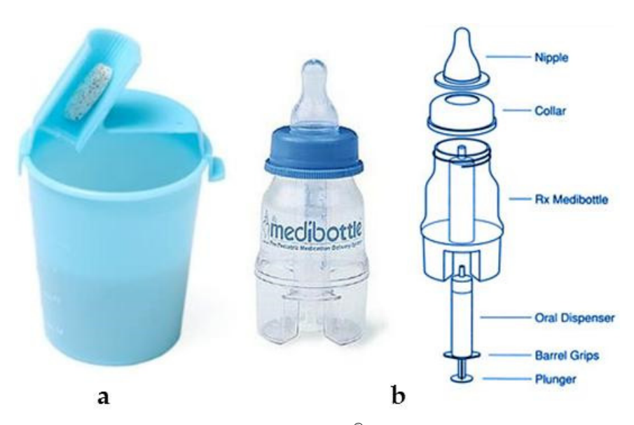
Figure 2. (a) ORALFLO<sup>TM</sup> cup; (b) Medibottle<sup>®</sup> medication delivery devices.

For infants and babies, liquid oral formulations exist, but palatability may vary and thus they may be difficult to administer. A number of innovative solutions have been created for the administration of oral medications for CYp. For children with the problem of pill swallowing, the ORALFLO<sup>™</sup> pill swallowing cup was developed. The patient drinks a beverage from this special cup and contextually assumes the unit dose present in a slot of the cup [50] (Figure 2a).